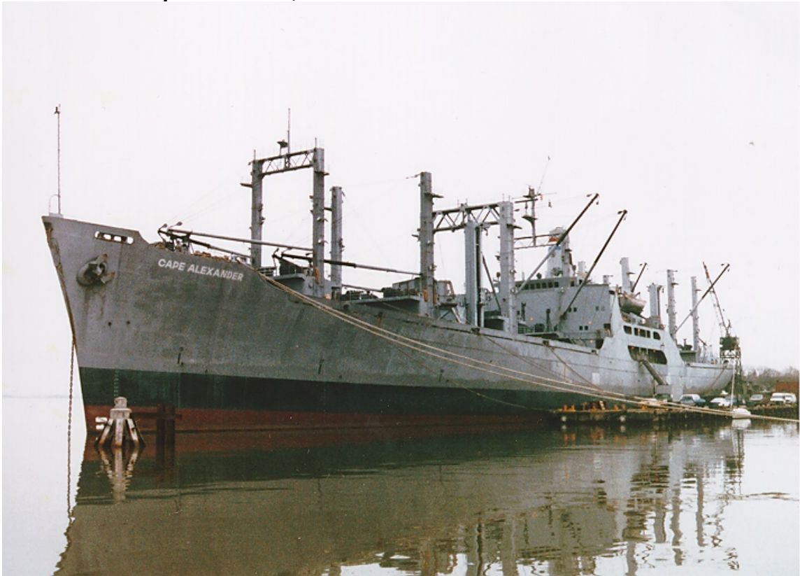
SS Cape Alexander at James River.