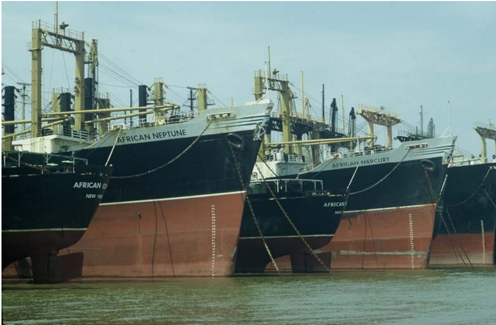
African Mercury, fourth from right, before its name was changed to Cape Ann. James River Reserve Fleet circa 1980.