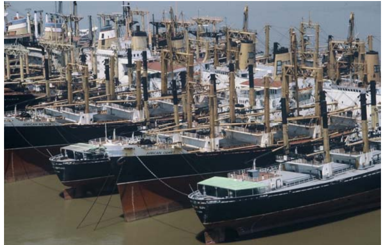
Top: SS Cape Alava underway. Right: SS African Comet at the James River Reserve Fleet circa 1980.