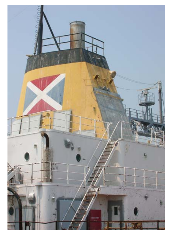
Clockwise from left: SS Resolute moored at the James River Reserve Fleet in 2008; the ship's superstructure; the ship's bridge; the ship's smokestack.