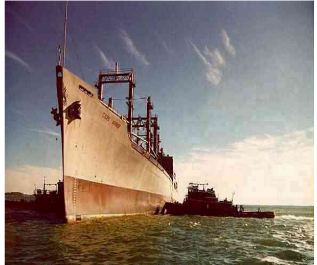
Left: SS Cape Avinof underway. Right: SS Cape Avinof.